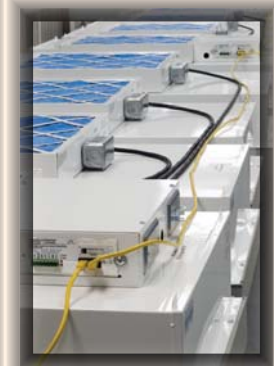
Fig. 3: SAMlink Control Housing Mounted on Master SAM Unit