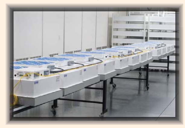
Fig. 1: Assembled SAMlink System in CRI Cleanroom

Factory wired junction boxes with integral distribution wiring. Substantially reduces on-site electrical work.